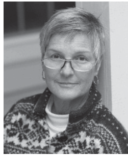
PEARLS OF WISDOM

The last time I visited my mother, she seemed out of sorts and was having difficulty remembering things. In addition to that, her house was dirty and she has always been an immaculate housekeeper. I'm very worried about her but she doesn't think anything is wrong or different. What should I do? — Wits End